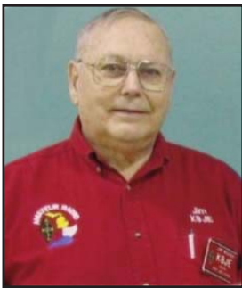
Members: The reason ARRL is