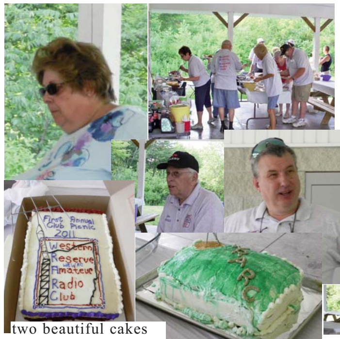
two beautiful cakes