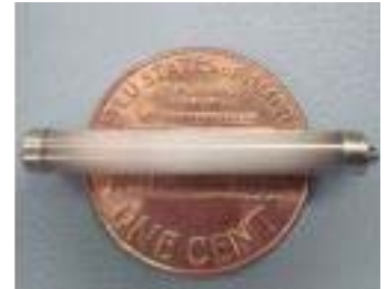
An implantable microstimulator of the kind that would be used with a wireless medical micropower network.

In their regular meeting on Wednesday, November 30, the four FCC Commissioners unanimously agreed to allocate spectrum and adopt service and technical rules for the utilization of new implanted medical devices that operate on 413-457 MHz (70 cm). These devices will be used on a secondary basis as part of the Medical Data Radiocommunication Service in Part 95 of the FCC rules. The Amateur Radio Service also has a secondary allocation on the 70 cm band. These new rules are the result of a Notice of Proposed Rule Making that the FCC released in March 2009. A Report & Order that will define these new rules is expected soon.