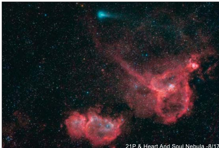
21P & Heart And Soul Nebula -8/17